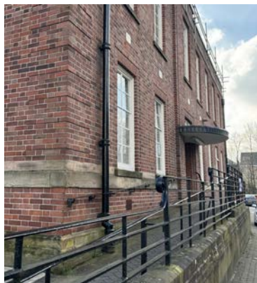
Padiham Library Town Hall, Burnley Rd, Padiham BB12 8BS