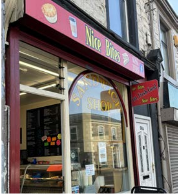
Nice Bites 98 Burnley Rd, Padiham BB12 8QN

Simply post your design into an entry box in one of the shops below