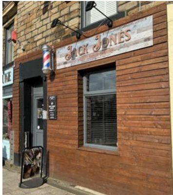
Jack Jones Barbers 91 Burnley Rd, Padiham BB12 8BL