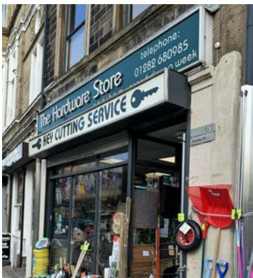
The Hardware Store 67 Burnley Rd, Padiham BB12 8BU