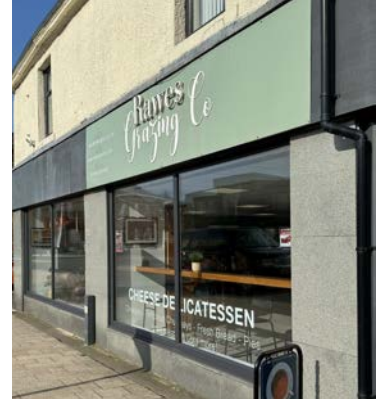
Rawes Grazing Co 105 Burnley Rd, Padiham BB12 8BL