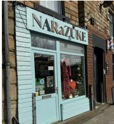
NARaZUKE 91a Burnley Rd, Padiham BB12 8BL