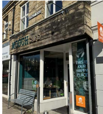
Mooch Cafe87 87 Burnley Rd, Padiham BB12 8BL