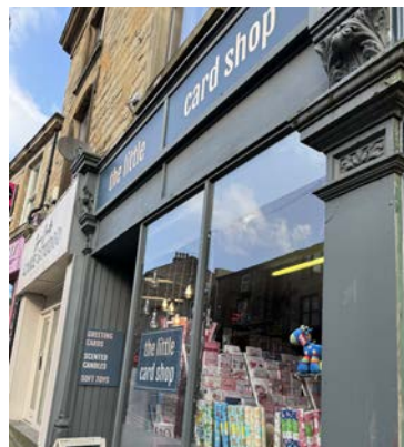
The Little Card Shop 31 Burnley Rd, Padiham BB12 8BY