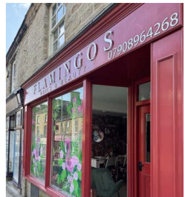
Flamingos Beauty Lounge 10 Burnley Rd, Padiham BB12 8BX