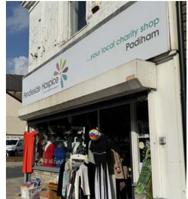
Pendleside Hospice Shop 79 Burnley Rd, Padiham BB12 8BL