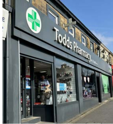
Todd's Pharmacy 135-139 Burnley Road Padiham BB12 8BA