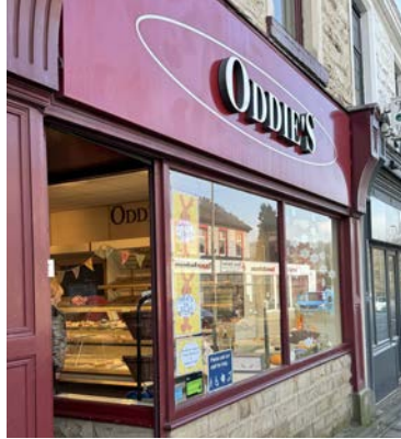
Oddies 92 Burnley Road Padiham BB12 8QN